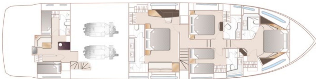
OPTIONAL LOWER DECK