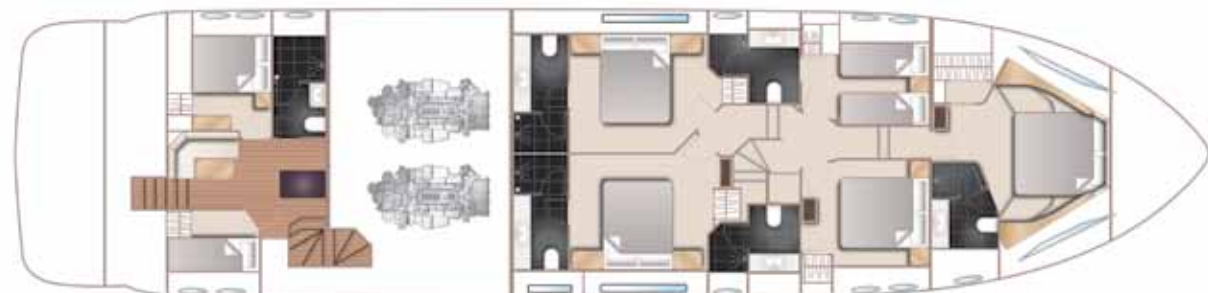
OPTIONAL LOWER DECK