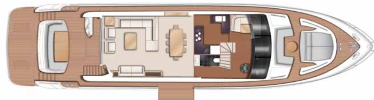
MAIN DECK WITH OPTIONAL BALCONY